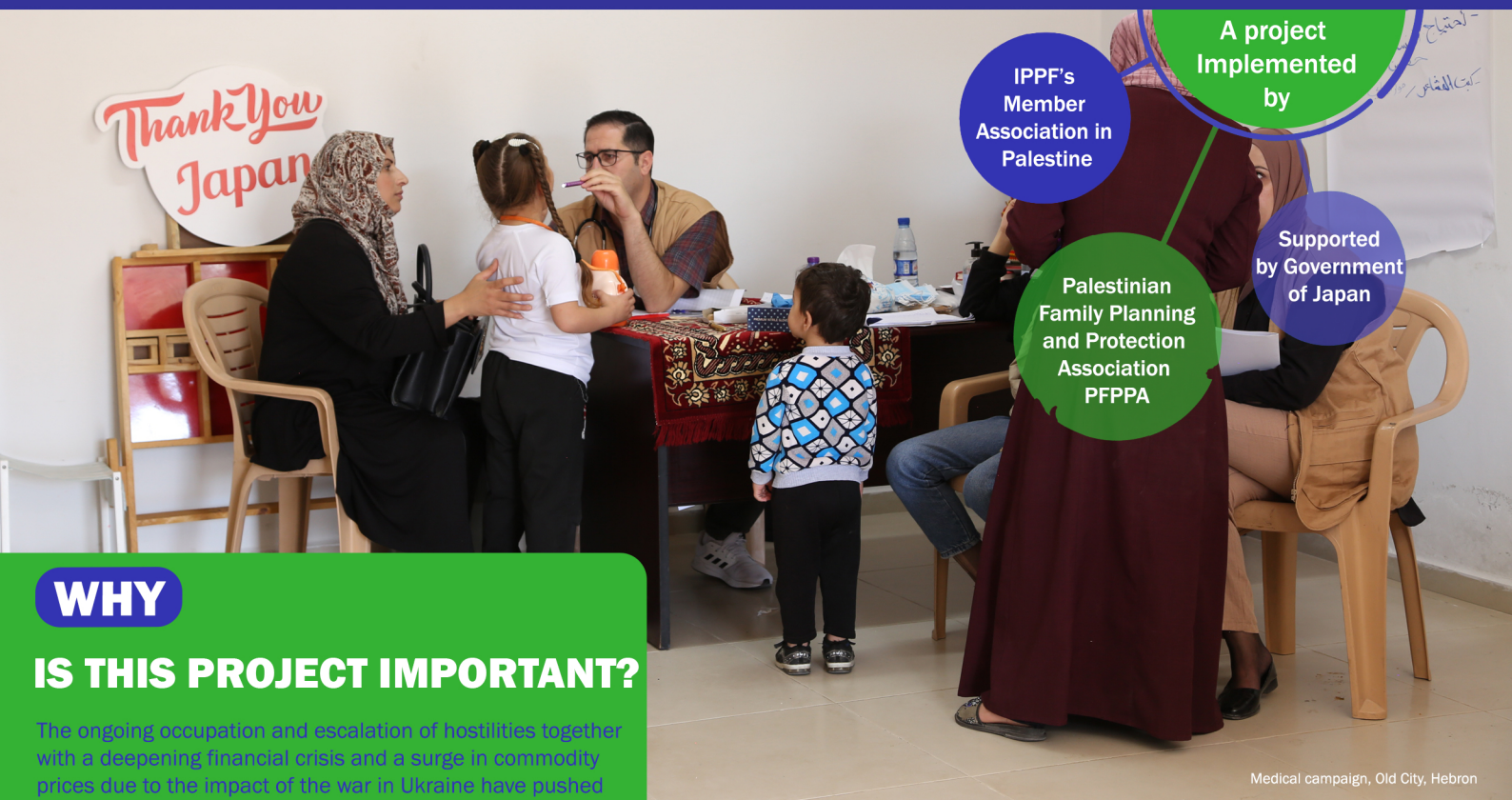
Medical campaign, Old City, Hebron