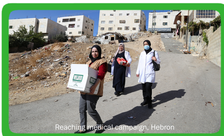
Reaching medical campaign, Hebron