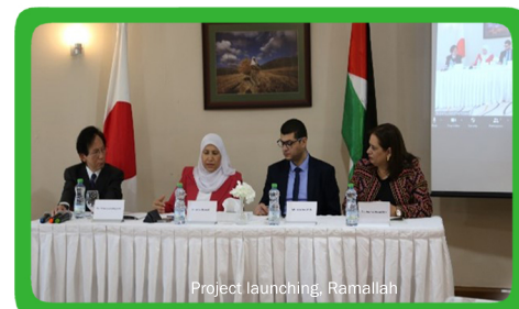
Project launching, Ramallah